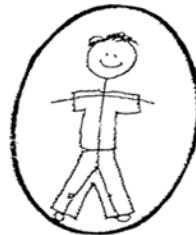
No offensive or secular clothing