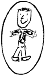
Common Sense in dress will make a better camp for you