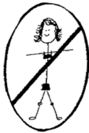
No bikini swimsuits. Tankinis are allowed. Cover-ups must be worn.