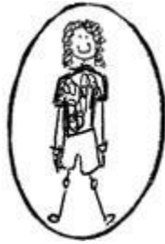
Shorts must be at least fingertip length