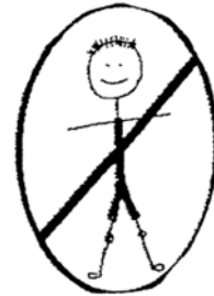
Guys and Girls. No tight shirts, shorts, or pants.