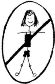
Guys and Girls. No tanks or bare midriffs. Girls: No cleavage shown