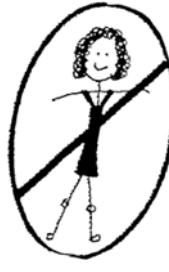
No low-cut shirts or dresses. No cleavage