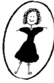
Dresses/skirts must be at least knee-length